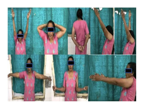
Fig. 5. Final follow up at 1.5 years postoperative showing full range of motion of left shoulder joint