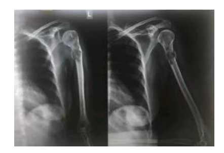
Fig. 1. Preoperative radiograph of left proximal humerus AP and lateral views showing an osteolytic eccentric lesion with a pathological fracture