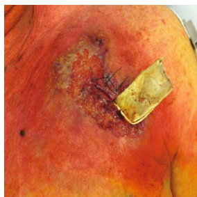
FIGURE 1: Purulent ulcer with dusky, violaceous borders on a background of erythema.