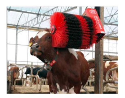
Fig. 2. Cow body brush

veterinarians and breeders for breeding, hoof trimming, treatment, immunization, expectation testing, embryo transfer, and other work.