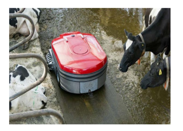
Fig. 6. Automated manure cleaning machines

or organic fertilizer, and the solids after the second sieving can be made into high-grade organic fertilizer. The screened effluent can be realized as a biogas project or otherwise treated and returned to irrigation.