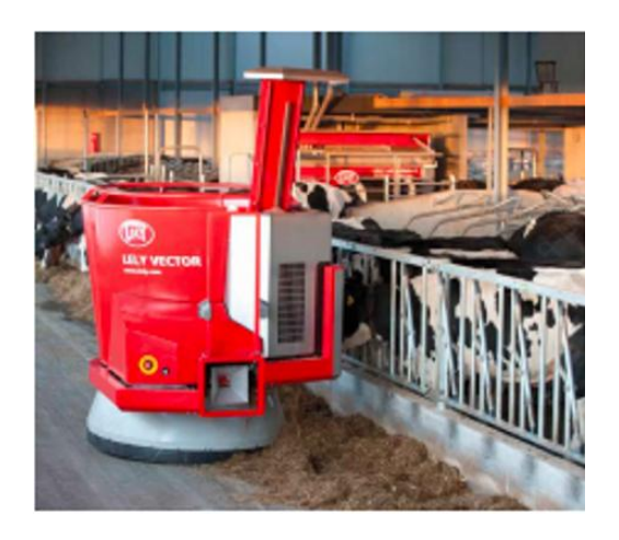
Fig. 4. Full mixed ration push sweeper

TMR is a process where all the forages in a recipe are calculated and put together, followed by kneading, mixing, and thorough blending in a special mixer truck. It is an advanced feeding process for feeding cows, who receive balanced nutrition with every bite they take [15]. The implementation of TMR has a good effect on improving the feed conversion rate, ensuring the health of the rumen and the body, and improving milk production and quality. In modern-scale farms, feeding labor productivity can be increased by more than 10 times compared to traditional farms [16].