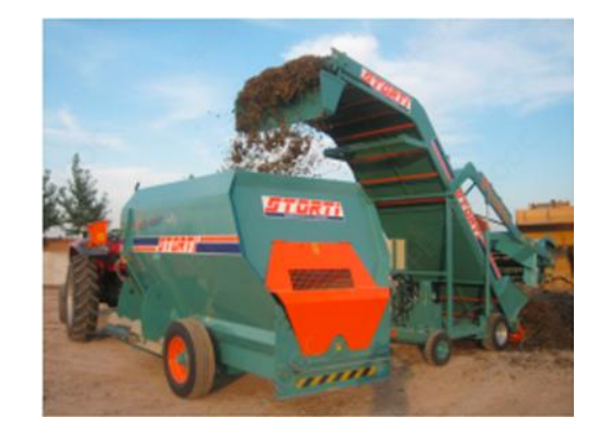
Fig. 3. Specialized transport vehicles with self-unloading function

head per day. That is, according to the average 305 days of milk production of 7000 kg, the daily consumption of corn silage needs 19.65 tons, a thousand cattle farms need at least 10,000 cubic meters of silage cellar and the annual storage of at least 7000 ~ 8000 tons of whole plant silage corn[13].