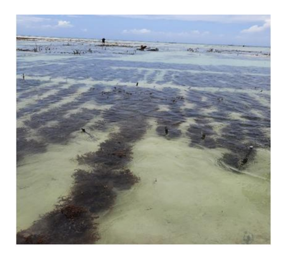
Fig. 1. Seaweed farm in Jambiani, Unguja

Burra and Devi; AJAEES, 40(11): 274-284, 2022; Article no.AJAEES.92559