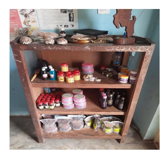
Fig. 5. Value-addition site in Kidoti, Unguja Fig. 6. Value-added seaweed products in Kidoti,