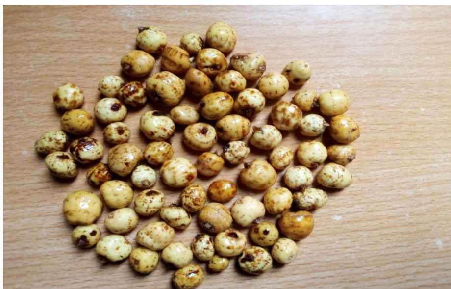
Plate 1. The Tiger Nut ( Cyprus esculentus )

The protein, crude fibre, ash, fat, moisture and carbohydrate composition of the yoghurts were determined as described by AOAC [29], while vitamins, minerals, phytochemical and physicochemical analysis were carried out accordingly