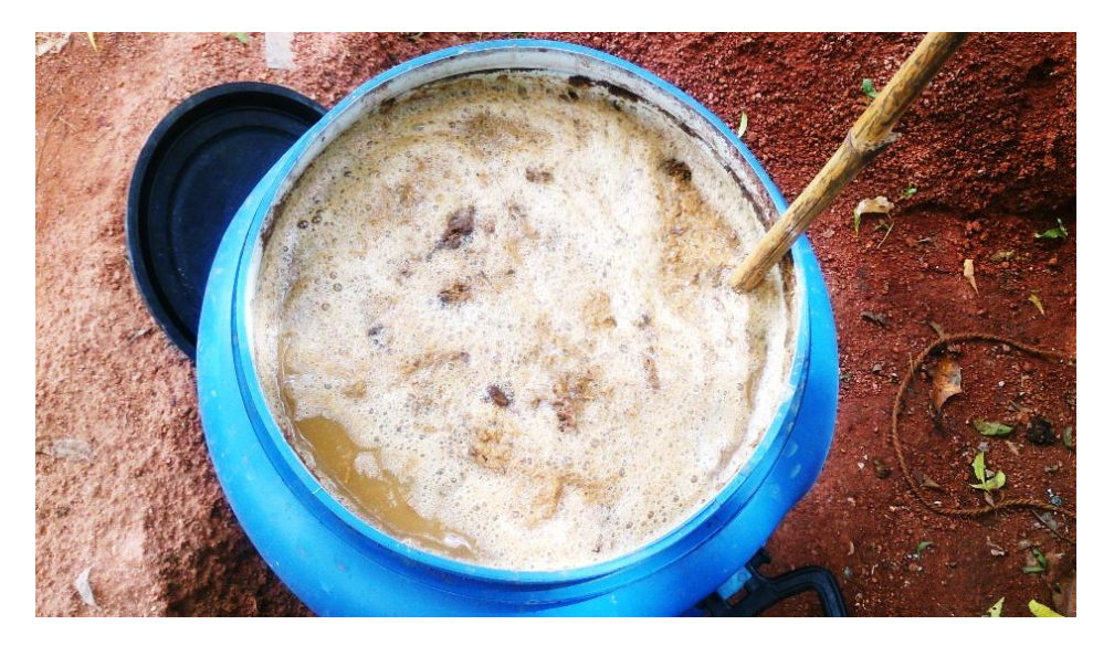
Fig. 3. Jeevamrutha