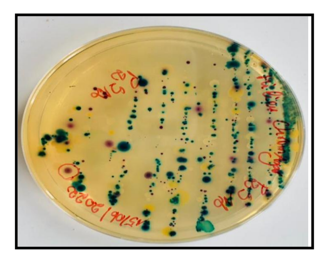
Fig. 2. Growth of bacteria from the urinary tract of house mice on ChromAgar<sup>™</sup> chromogenic differential medium

Escherichia coli is a ubiquitous bacterial species highly diverse that forms an important part of the normal intestinal flora of humans and armblooded animals. In order to test for the probable presence of the human pathogenic E. coli O157: H7 variant in the urinary tract of house mice, Escherichia ChromAgar<sup>™</sup> coli colonies isolated on orientation medium were transferred to E. coli O157: H7-specific chromogenic medium. The E. coli O157 : H7 variant is characterized by large, light pink colonies with a halo (Fig. 3). Among the 10 Escherichia coli strains detected, 5 strains were able to grow on the Chrom E. coli O157:H7 medium, i.e. an overall frequency of 50 %. At the site level, the occurrence of this variant is 75 % for site 1 and 33.3 % for site 2. Although mice in site 1 are 6 times more likely to be contaminated by this human strain than in site 2, the frequencies obtained are not significantly different (OR<sub>1/2</sub>= 6.00 ; 95 % CI (0.35, 101.57) ; P = 0.524).