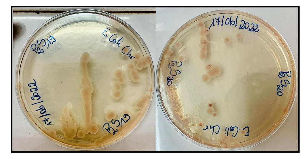
Fig. 3. Escherichia coli colonies on chromogenic medium specific E. coli O157: H7

N: Number of urine samples collected and analyzed