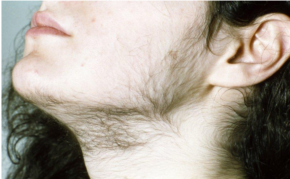
Fig. 2. Patients with poly cyst ovary syndrome