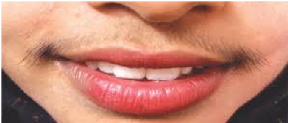
Fig. 3. Steroid induced hirsutism patient