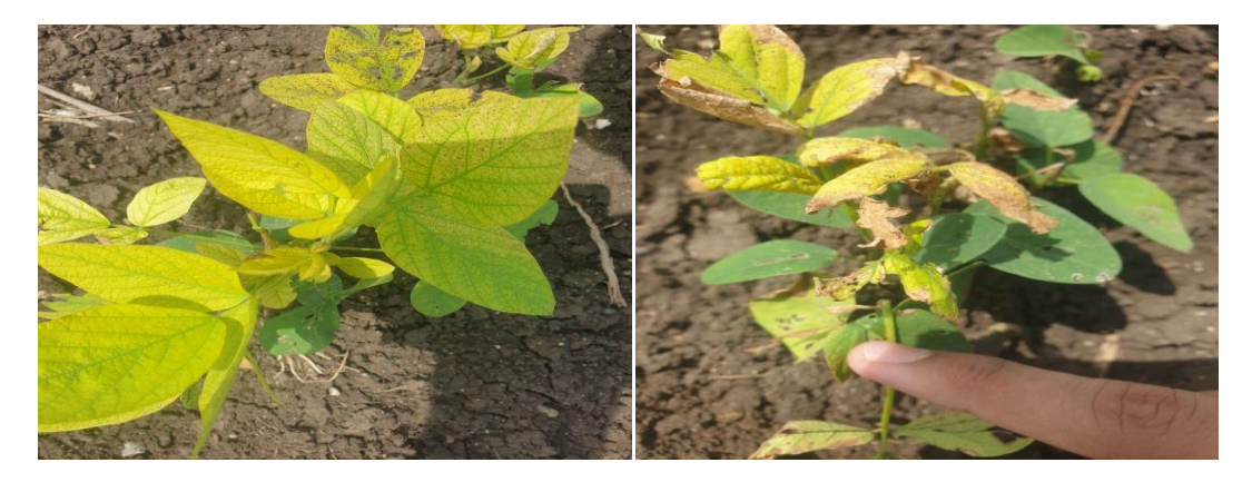
Fig. 2. Sulphur deficient plants: Chlorosis

Sulphur deficiency in plants refers to a condition in which plants do not receive an adequate supply of sulphur, which is an essential nutrient for their growth and development. When plants lack sufficient sulphur, they can exhibit various symptoms and physiological problems that can negatively impact their overall health and productivity.