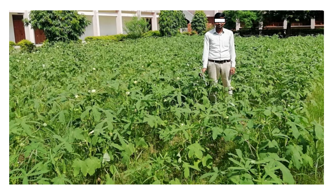
Fig. 2. Researcher in the Farm of Okra during the study period

Kumar et al.; Int. J. Plant Soil Sci., vol. 35, no. 19, pp. 850-856, 2023; Article no.IJPSS.104580