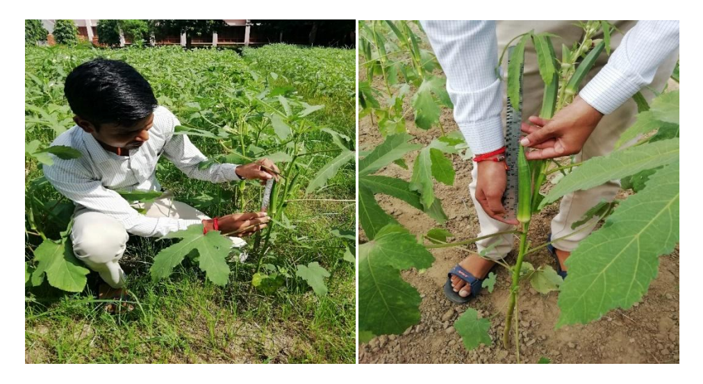
Fig. 3. Measurement of Okra by researcher during the study