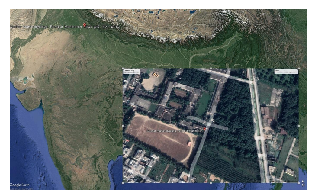
Fig. 1. Example of location on the satellite map of the experimental field. Unfortunately, the very limited information on the location of the experimental field does not allow obtaining a better map (which also allows the visualization of the plots corresponding to the 17 treatments plus the control)