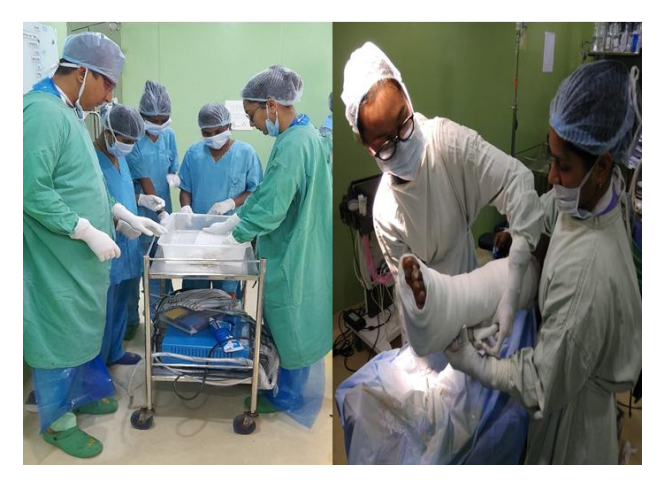
Fig. 3. Showing training and learning of offloading (TCC) under supervision