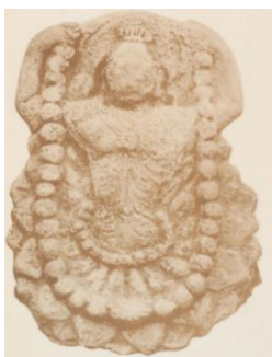
Figure 3. The ruins of Dandan Urik destroyed the decorative fragments of the Temple

arrangement is similar to the bead pattern, as an art form carrying religious teachings.