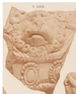
Figure 4. Pottery shards unearthed in Jotekan

Lianzhu pattern as an artistic pattern was unearthed in the Central Plains earlier than in the West. Lianzhu patterns have appeared as decorative patterns on people's daily utensils in the Xia and Shang dynasties. In the late Xia Dynasty, there are clear and coherent Lianzhu patterns on the lotus, and the outer edges of the leaf vein bronze mirrors in the late Shang Dynasty are also decorated with Lianzhu patterns. In the Tang Dynasty, Chang'an, as an economic and trade center and cultural center, had a large number of decorative patterns of beads on the lotus pattern tiles. This combination of lotus and beads is full of strong religious meaning, and is also a proof that the Sassanid culture and the Central Plains culture exchange has been recognized.