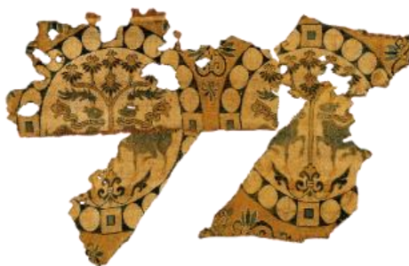
Figure 2. The pattern of the tree of life in the deer pattern brocade

The common auxiliary pattern in the popular brocade in the Tang Dynasty was the tree of life pattern. This element is located in the middle of the pattern, so that the branches, fruits and deer patterns on both sides form a suitable pattern to be distributed within the group. With the tree of life pattern, its branch form is mostly a three-branch structure with the main trunk as the center and mirror images on both sides. The tree-like structure constitutes a pattern support suitable for the group. Most of the species of the tree of life are mango leaf clusters, which are composed of seven leaves. The clumps are neatly arranged, and the tops are raised like the fruit patterns of grapes or pomegranates, forming a plump and intricate decorative image.