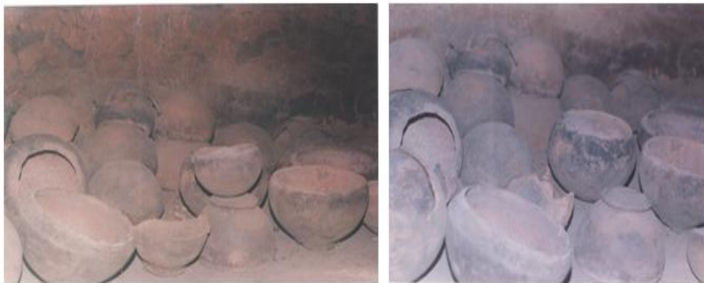
Fig. 3. Pots found in the hole

For instance, the presence of human remains at the outer part of the chamber may signify the honour done to a personality by burying alive his or her security guard (s) or servant (s) with him or her. However, tilting towards the direction of status in this case may be too hasty because the culture materials in the inner chamber covered with a lid are yet to be identified. And until excavation was done, its history will remain in store. If it was a grave, it could be a possible cause of their migration to another location; hence, some migrant ethnic groups like the nomadic Fulani used to abandon their settlements once they lost a member. However, the claim may be justified if the bones showed evidence of a disease or human attack. According to Idris Amali, the Idoma, Igala, Bassa, Ebira, Edo and some ethnic groups around Calabar axis were ethnic groups in Nigeria that at one time or the other buried kings with slaves or servants in such type of graves [13]. All these assumptions could be explained better when a