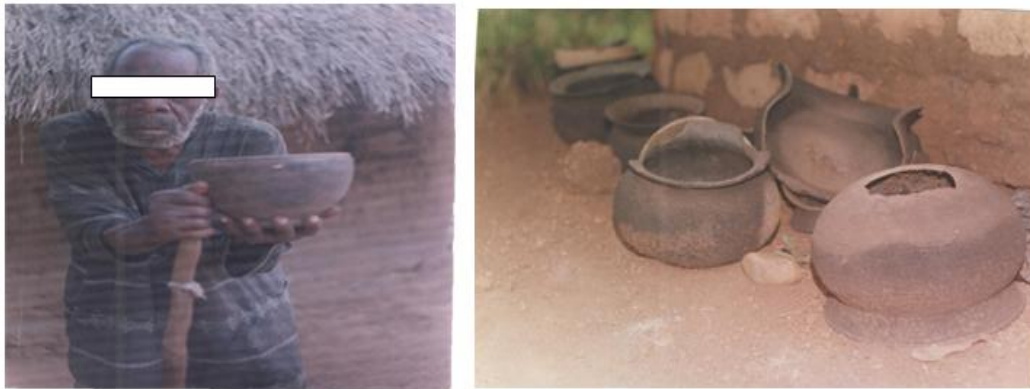
Fig. 2. The village head holding one of the pots