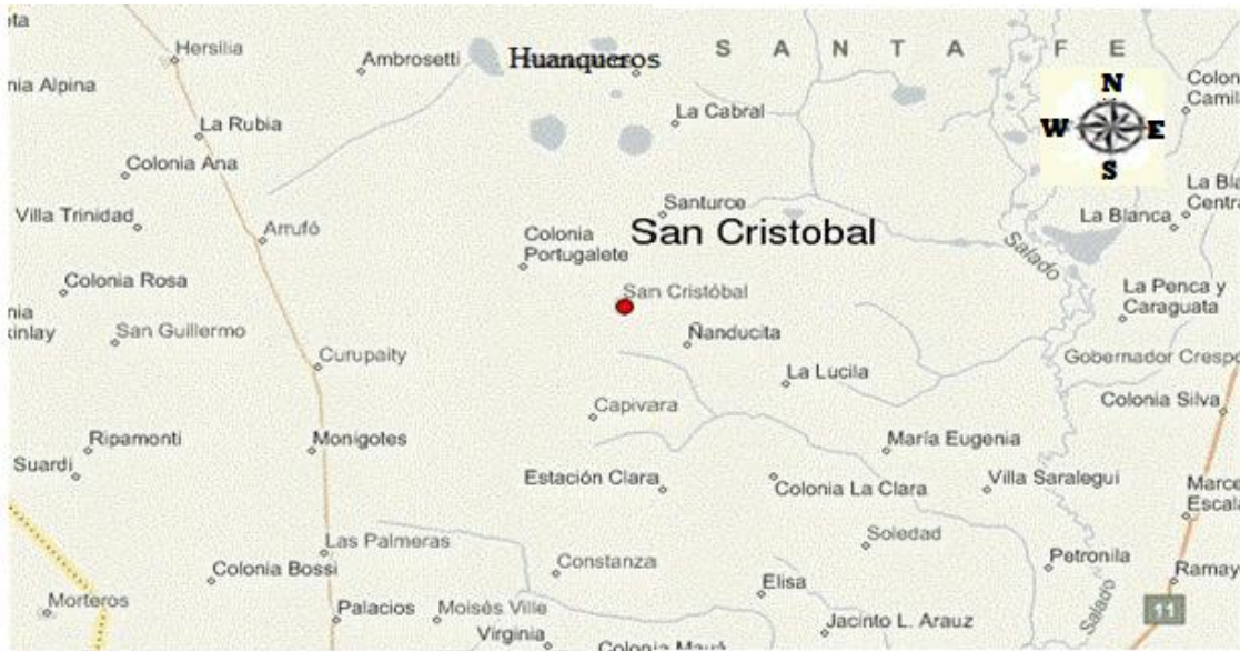
Fig. 1. Map of San Cristobal and Huanqueros source [23]