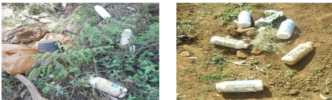
Fig. 3. Pesticide containers improperly disposed of on-farm and neighbourhood

Farmers did not have access to information about integrated pest management, pesticide usage and safety, insect and disease identification, and quality aspects of their vegetable crops. Sixty percent (60%) of the farmers were aware of the fact that pesticide residues could be present on the harvested