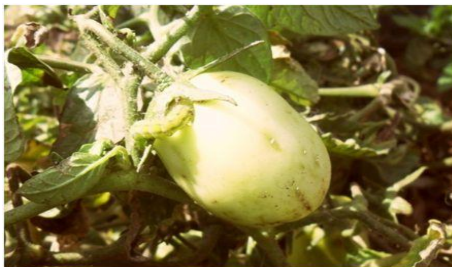
Fig. 2. Fruitworm ( Helicoverpa amigera ) attacking fruit