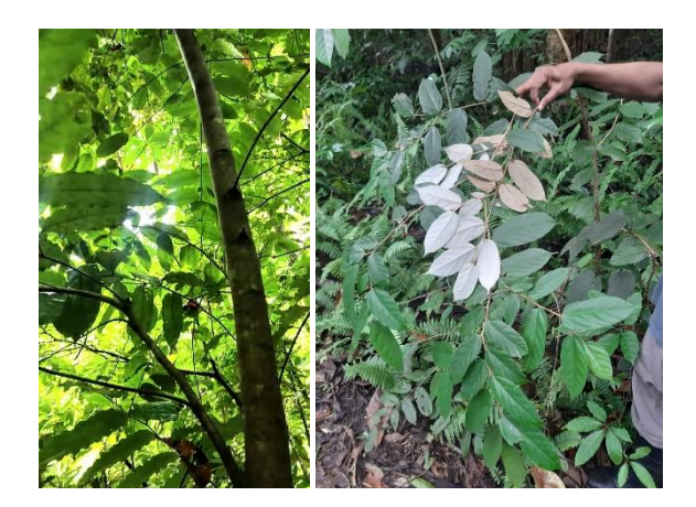
Fig. 3. Pterospermum celebicum Miq. (Endemic flora in BNTP area, North Sulawesi)

Butarbutar et al.; Asian J. Biol., vol. 16, no. 4, pp. 1-8, 2022; Article no.AJOB.94962