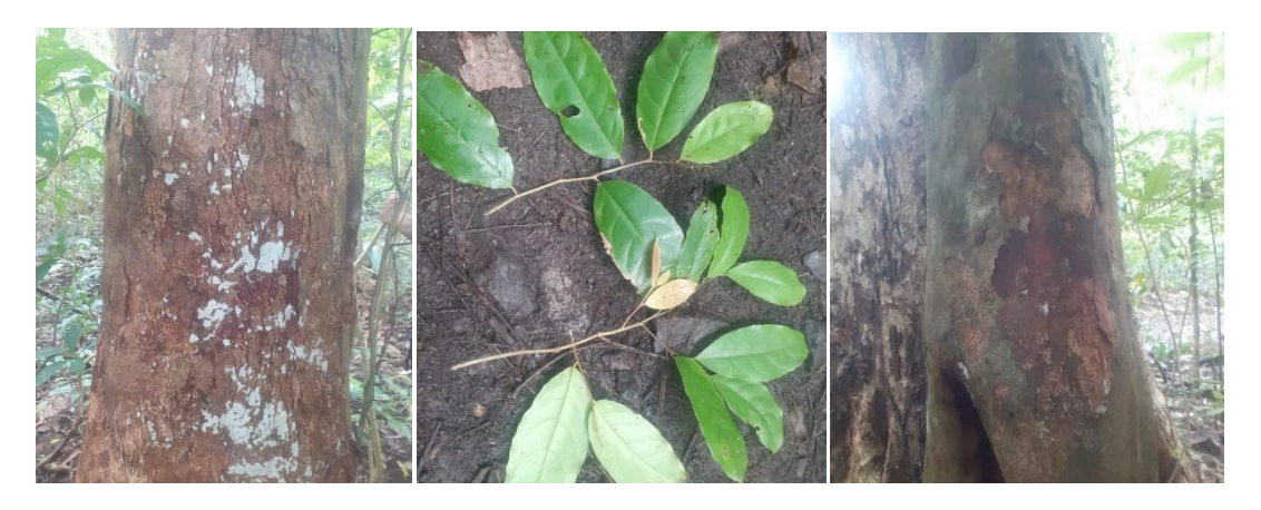
Fig. 4. Homalium celebicum Koord. (Endemic flora in BNTP area, North Sulawesi)

The value of plant species diversity at each tree level is greater than 3. The level of the sapling with a diversity index of 3.75, the level of the pole with a value of 3.15, and at the tree level with a value of 3.11. On 47 plots or plots of observations obtained relatively equal diversity index values. This shows that the habitat conditions in all observation plots are relatively homogeneous, when viewed from the aspect of disturbance to the ecosystem, because in all places in BNTP there is no periodic destruction. This is understandable because the area is a nature conservation area. The results of the calculation of the species evenness index showed that the values were relatively homogeneous, ranging from 3.11- 3.75. The diversity of flora species at the level of trees, poles and sapling in the BNTP area is included in the category of high abundance. This means that the diversity of flora species in the community is increasingly stable in the BNTP area.