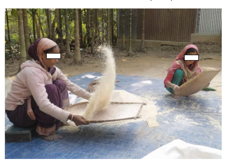
Fig. 2. Typical rural women in Bangladesh

Table 5 All the respondents (100%) identified male-dominated society as the main barrier to participation. Meanwhile, restricted social interaction (95%) also a barrier as their mobility outside their household boundary was very limited. They had limited access to resources (86.25%) such as land, capital, credit. Lack of ownership on assets (81.25%), lack of economic empowerment (75%), lack of technical knowledge (72.5%), lack of decision-making power (66.25%) were also major barriers to rural women's participation.