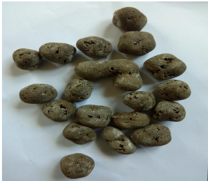
Fig. 3. The enteroliths removed at post mortem, total weight of 483g, average weight of 24.15g, and average measurement of 3.24cm x 2.61cm x 2.46cm