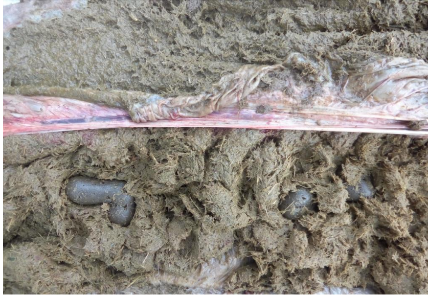
Fig. 2. Enteroliths in situ