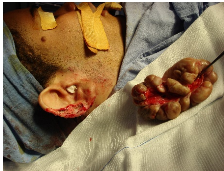
Figure 5. Perioperative—surgical specimen.