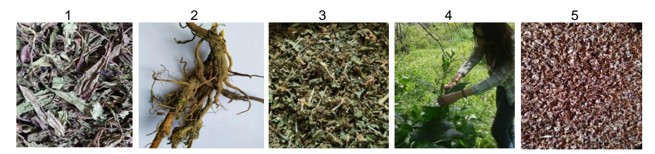
Fig. 2. Some pictures of the collected samples. The leaves of Rumex pamiricus Rech. f. (1); the roots of Rumex conglomeratus (2); the aerial part of Rumex confertus Willd. (3); The process of collecting R. Pamiricus Rech. f. (4); the seeds of Rumex confertus Willd. (5). Location: Tashkent Botanical Garden named after F. N. Rusanov.

The aerial parts (during the flowering period on May 2020) and roots (on August 2020) of the plants were collected from Botanic Garden, Tashkent, Uzbekistan.