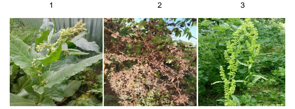
Fig. 1. R. pamiricus Rech. f. (1); R. confertus Willd. (2); R. conglomeratus Murray (3). Location: Beldersay, Chimgan mountains (Ugam Chatkal National Park), Tashkent region.

kinds of bacterial and fungal infections, e.g. dysentery, enteritis and acariasis" [30]. "R. crispus has a long history of domestic herbal use in India and Pakistan. It is a gentle and safe laxative and useful for treating a wide range of skin problems (sores, ulcers and wounds). The root of the plant is alterative, mildly tonic, antiscorbutic, cholagogue and astringent, while the seeds effective in the treatment of diarrhea" [31,32]. In Australia Rumex species are used for the treatment of stings [33]. The extracts of some Rumex species (R. hymenosepalus and R. maderensis) are used as a "blood depurative" or "blood purifier" [34,35]. "Literature demonstrates that R. hastatus is traditionally used in the treatment of sexually transmitted diseases, including AIDS" [36]. "R. nepalensis is applied to treat stomachache in Ethiopian regions. R. vesicarius is a wild edible Egyptian herb. In folk medicine, it is used as a tonic and analgesic and the treatment of hepatic diseases. for constipation, poor digestion, spleen disorders, flatulence, asthma, bronchitis, dyspepsia, vomiting and piles, among others" [37]. "The roots of R. confertus are used for liver diseases,