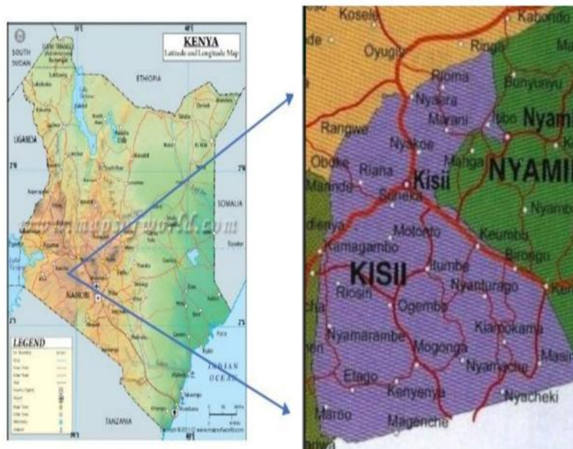
Fig. 1. A map showing Kisii County

The current study utilized cross-sectional healthy point study design. All malaria out-patient participants diagnosed with uncomplicated malaria clinically were recruited to this study.