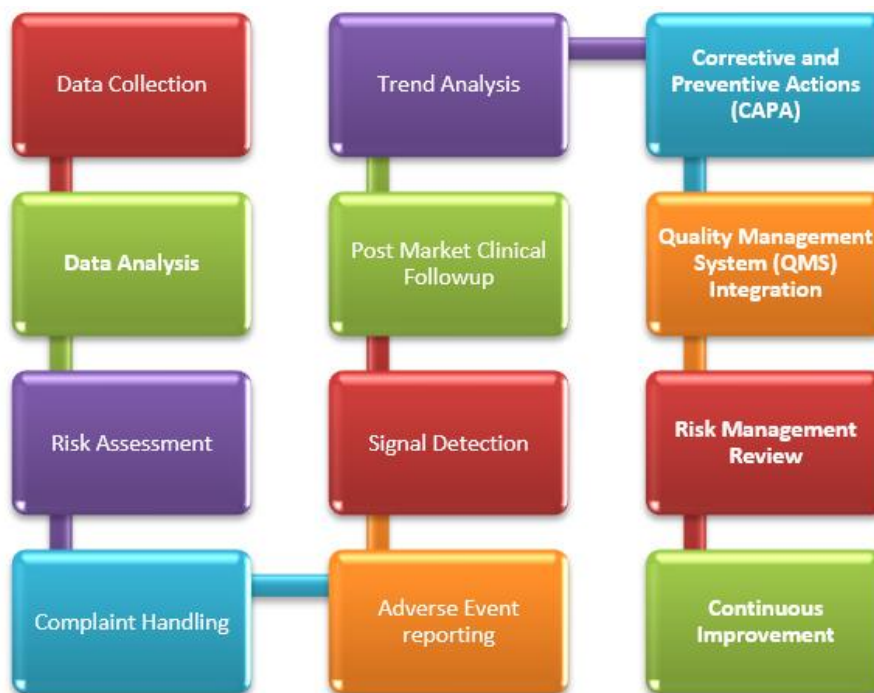
Fig. 3. Steps of PMS

Moreover, the utilization of AI in the monitoring of medical devices enables the practice of personalized medicine through the analysis of extensive datasets to identify trends and forecast specific health progressions[27]. The capacity to forecast is especially advantageous in the care of chronic diseases, as artificial intelligence can detect minute variations in a patient's state that may go unnoticed in conventional monitoring[28]. AI-powered gadgets alleviate the workload of healthcare personnel by automating repetitive processes and offering decision-making assistance, enabling clinicians to priorities patient