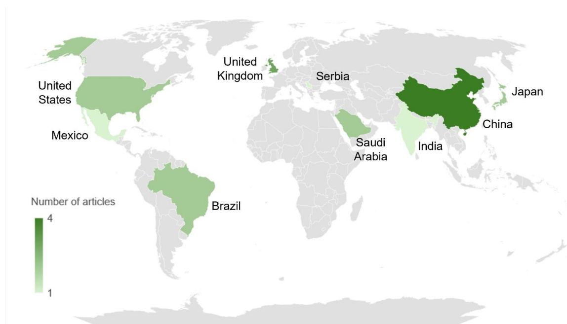
Fig. 2. Geographic distribution of the publications. Note that the American continent contributed with 10 articles selected in the present review, approximately 55%

Increased urinary excretion of transferrin predicted the development of microalbuminuria in a cohort of normoalbuminuric type 2 diabetic patients, regardless of age, duration of diabetes, blood pressure, HbA1c, and baseline lipid levels [36].