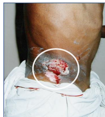
Fig. 2. Photographs showing ulcerative growth of size 4x3 cm with everted edges