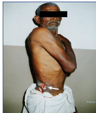
Fig. 1. Photographs showing ulceroproliferative growth on right waist

Histopathology reports confirmed the presence of squamous cell carcinoma with tumour-free margins. Postoperatively, the wound healed well without any complications. After a five-year follow-up, no locoregional recurrence was observed (Figs. 1-4).