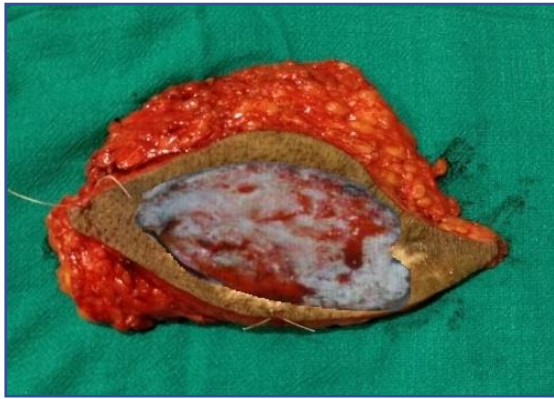
Fig. 3. Photographs showing wide excision of growth with 2 cm margin