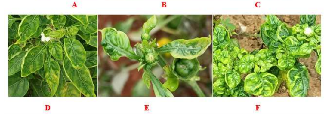
Plate 1. Disease rating scale for virus disease in capsicum

incidence and percent disease index. Observations viz. , location, area, variety, stage of the crop, incidence (%) and severity (%) was recorded. And the different type of symptoms produced by capsicum virus disease were observed and recorded. The percent disease incidence and percent disease index was calculated by using the below mentioned formula.