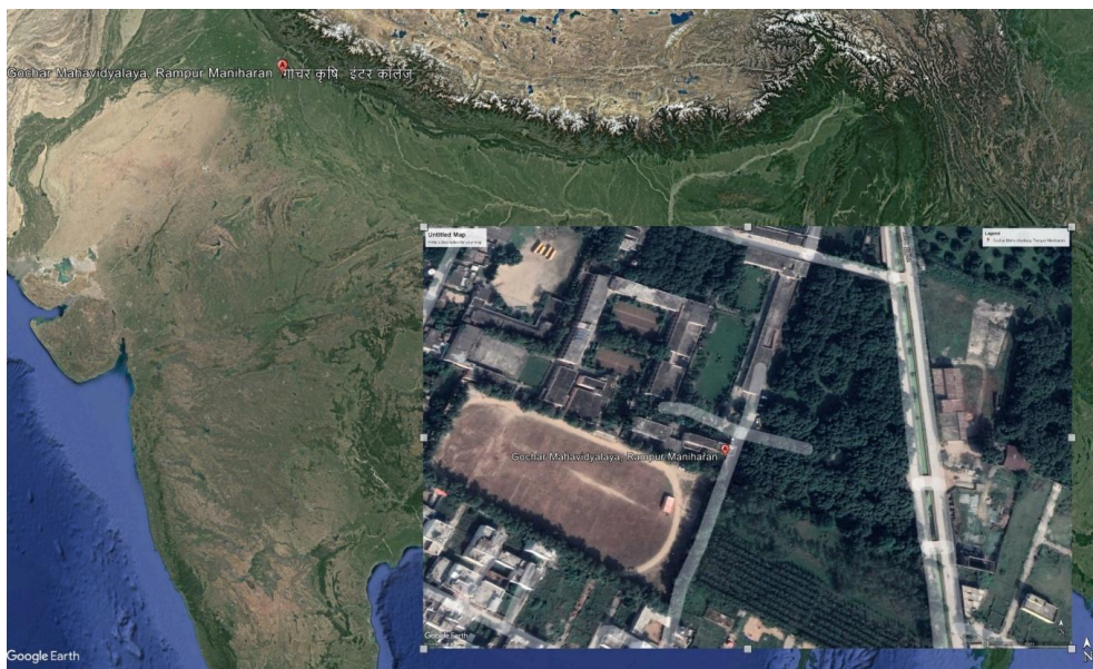
Fig. 1. Example of location on the satellite map of the experimental field. Unfortunately, the very limited information on the location of the experimental field does not allow obtaining a better map (which also allows the visualization of the plots corresponding to the 17 treatments plus the control)