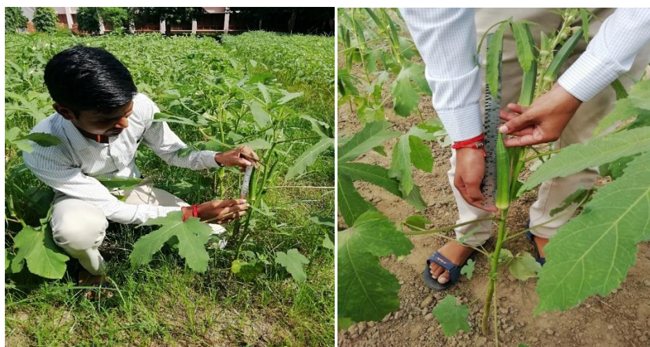
Fig. 3. Measurement of Okra by researcher during the study