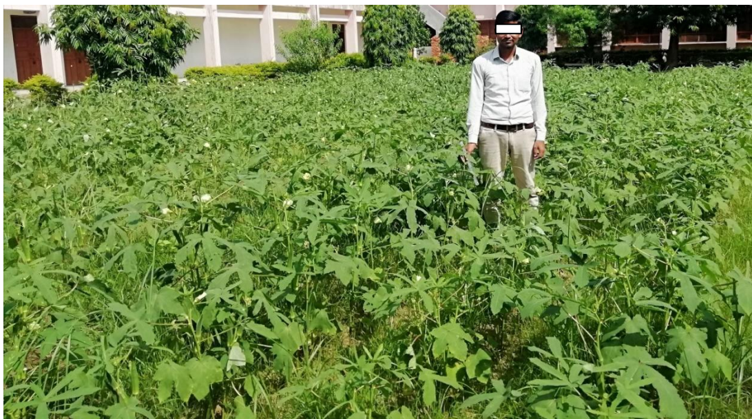
Fig. 2. Researcher in the Farm of Okra during the study period