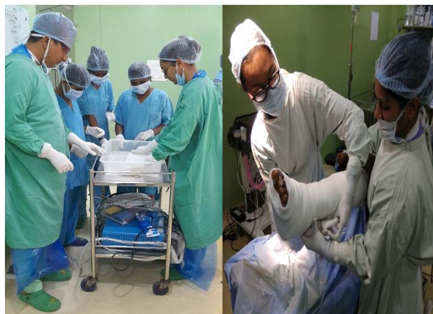
Fig. 3. Showing training and learning of offloading (TCC) under supervision