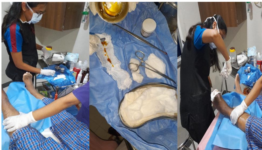
Fig. 2. Showing application of honey on wounds

Having understood, assisted, and learnt different offloading techniques from this institute under supervision of Dr Amit Jain over years (Fig. 3), I started using different offloading methods. I even provide training on Type 1 offloading [28, 32] to nurses and other interested paramedics in view of its simplicity and ease. Further, we have also done research on offloading [32, 33].