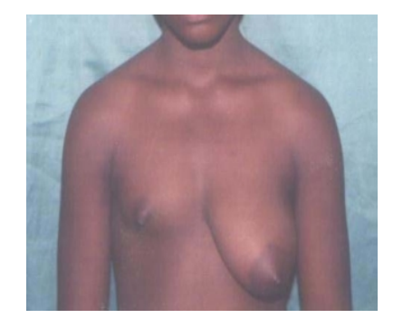
(b) Unilateral Hypoplasia in a 17 year-old girl

(a) Bilateral Hypoplasia in a 16 year-old girl