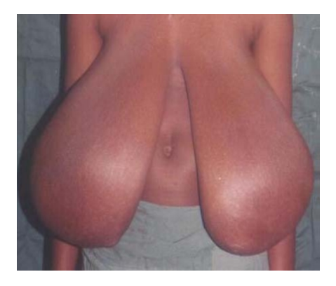
Fig. 5A. Juvenile macromastia (Source: Author) Fig. 5B. Macromastia (Source: Author)

Poland Syndrome is the most frequent cause of breast hypoplasia or aplasia; the right side is often affected than the left with men more frequently affected than women to the ratio of 3:1 (Borschel et al. and da Silva Freitas, 2007). Gynaecomastia is the commonest form of breast hyperplasia occurring in 30-57% of healthy men (Lanitis et al., 2008). Gynaecomastia could occur as a result of delay on testosterone secretion leading to greater oestrogen effect. Gestational gigantomastia is a rare connective tissue disorder estimated to occur in 1 out of 28,000 to 100,000 pregnancies worldwide (Dancey et al., 2008).