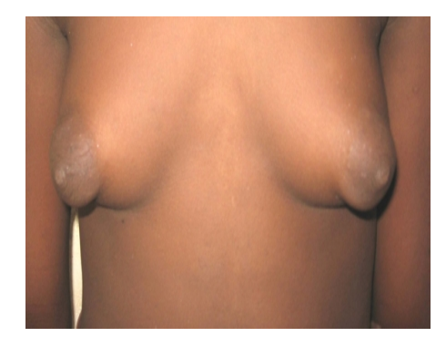
Fig. 2. Tuberous/Tubular breasts in a 15 year-old

Another form of BDA is Tubular/tuberous breast (breast shaped like a tube) (Fig. 2).