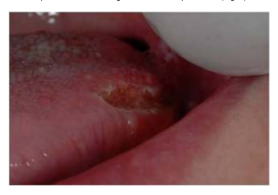
Fig. 2. The lesion is completely removed. The wound is in haemostasis, it doesn't need sutures

laser at 1.6W Ton 100 ms Toff 100 ms, optical fiber 300 micron, 226 J/cm² (Fig. 2), making a circular incision around the lesion. Control at 30 days showed the complete healing of the surgical wound (Fig. 3). The post operative period lacked of negative events and the healing was perfect. The histological analysis of the surgical piece revealed a keratinized squamous epithelium, with the internal surface covered of keratin blades and the external surface of gingival tissue components and so a diagnosis of EC was performed (Fig. 4).