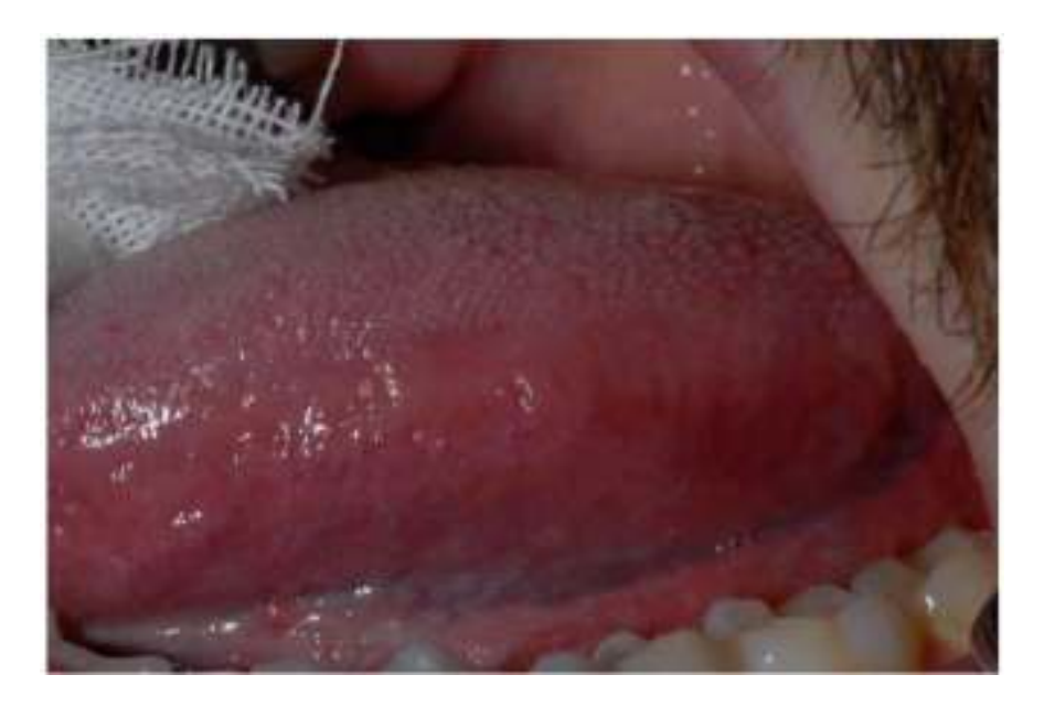
Fig. 3. Healing of the wound after 30 days