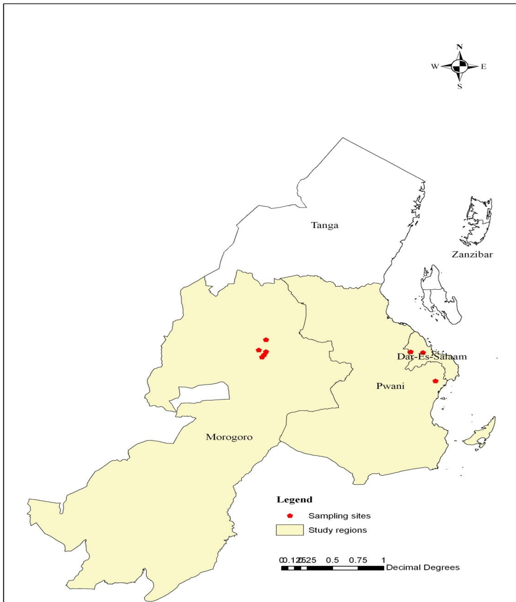
Fig. 1. Map of Eastern Tanzania showing study regions and sampling sites

were collected from featherless or poorly feathered parts of pigeon cadavers suspected to have died of pox (Fig. 2), or live pigeons suspected to have pox; in Morogoro (n = 11), Pwani (n = 2) and Dar es Salaam (n = 4) regions of Eastern Tanzania. Pieces of cutaneous nodular lesions collected from the same bird were pooled as a single sample. Each sample was labeled and stored in a deep freezer at - 20°C.