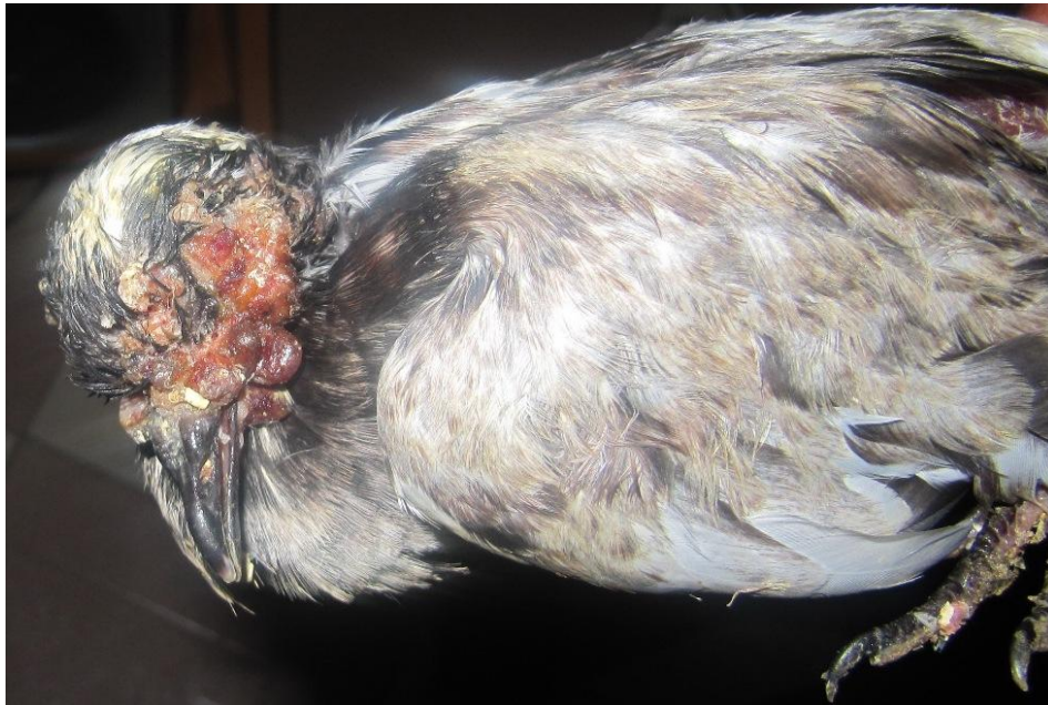
Fig. 2. A pigeon cadaver found in one of the pigeon flocks in Morogoro Municipality, Tanzania, presenting proliferative cutaneous nodular lesions at the base of the beak and featherless parts of the head. Note obstruction of vision caused by a complicated eye lesion with caseous material

Conventional PCR was conducted in Takara PCR Thermal Cycler (Takara Bio Inc., Japan) using a set of primers designed to amplify the P4b gene (virus core protein) (Table 1). The components of each amplification reaction and the cycling parameters were as described by Masola et al. [30]. PCR products were run in 1.5% agarose gel and visualized under UV light using UVI tec transilluminator and photographed using a digital camera.