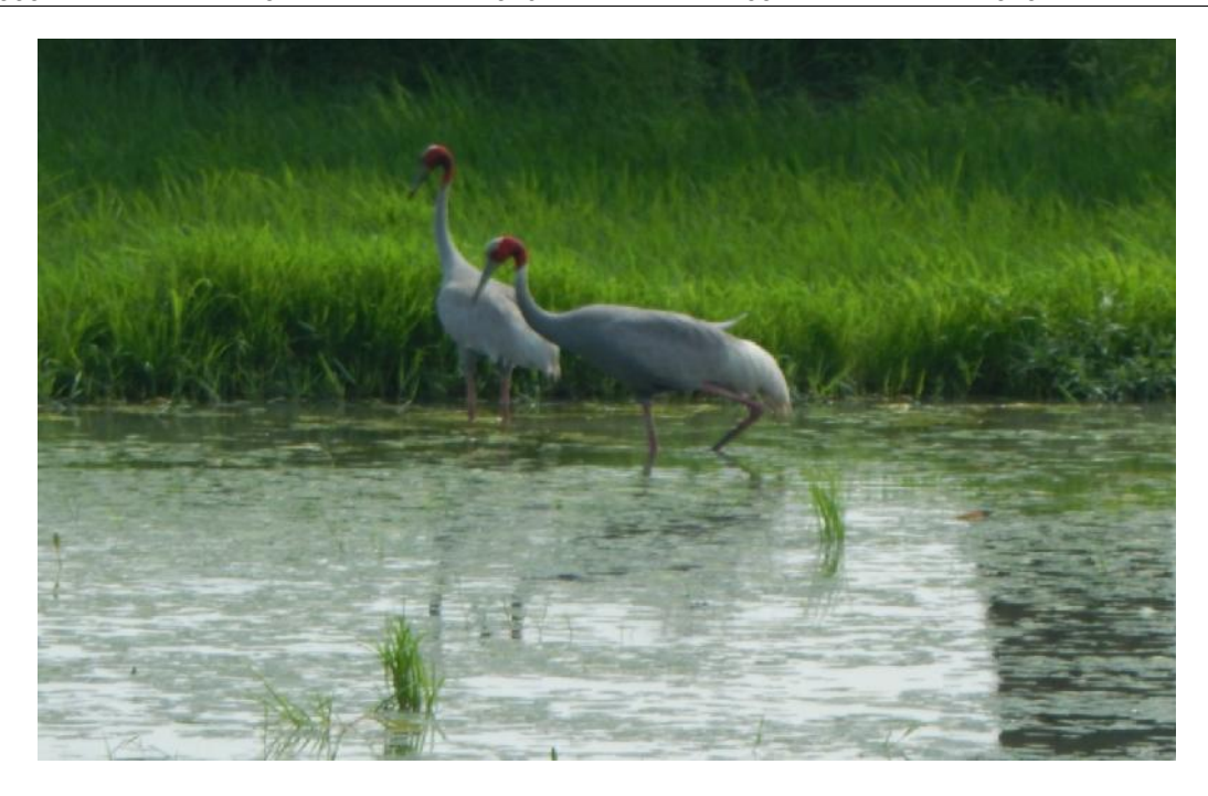
Fig. 3. Paired sarus crane in study area around Alwara Lake