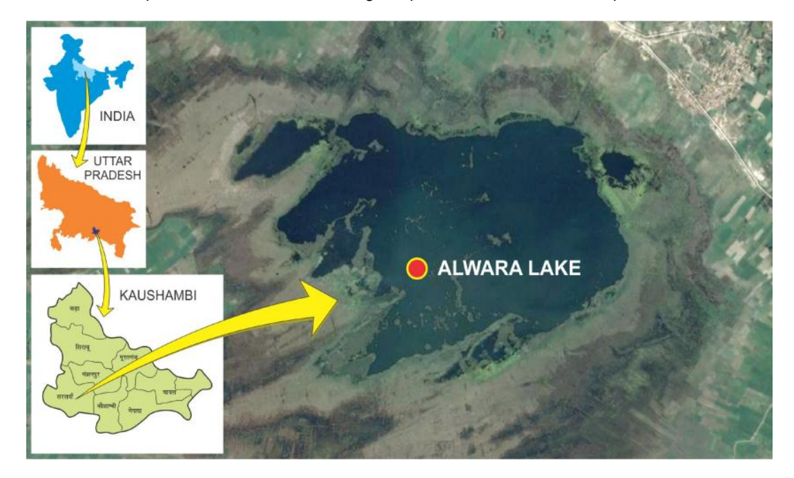
Fig. 1. Study area in Kaushambi district of U. P. (India)

commences in mid October and ends in late fluctuation over the year and noticed determinant November. Temperature shows with high parameters of this landscape.