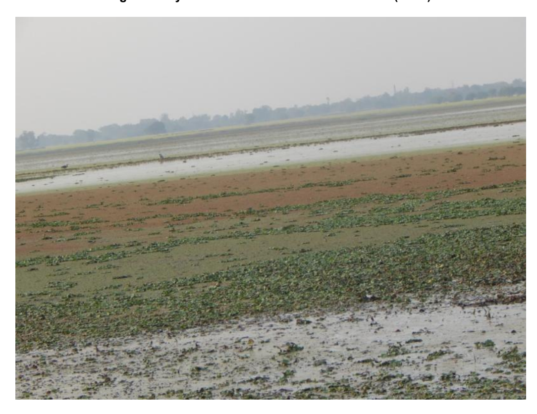
Fig. 2. A view of Alwara Lake of Kaushambi, U.P. (India)