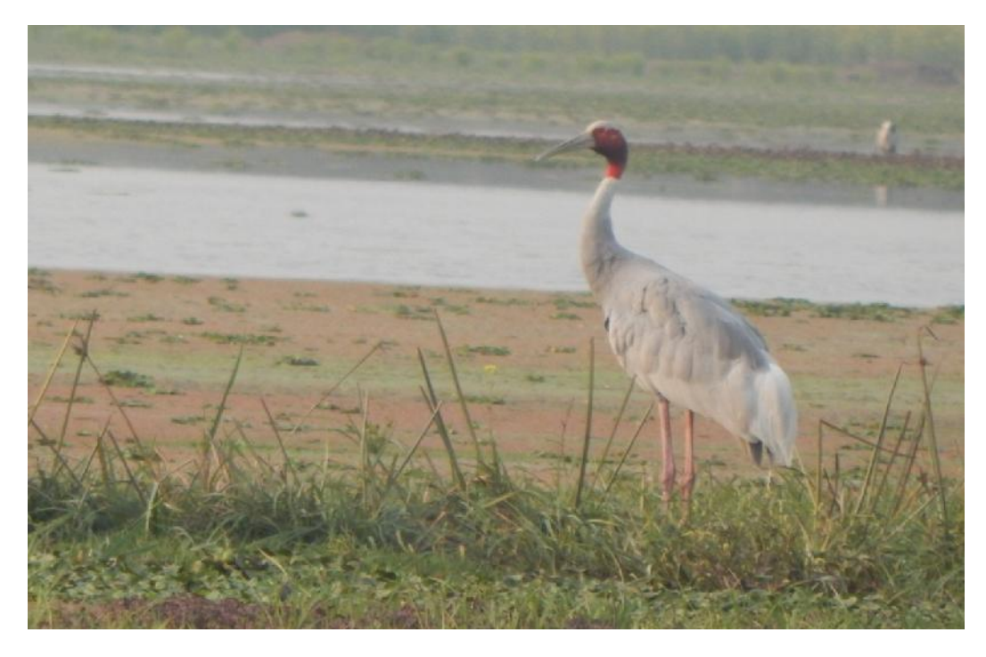
Fig. 5. Sarus crane in solo around the study area