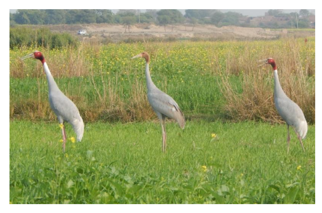
Fig. 4. Sarus crane pair with juvenile in agro paddy field around Alwara Lake