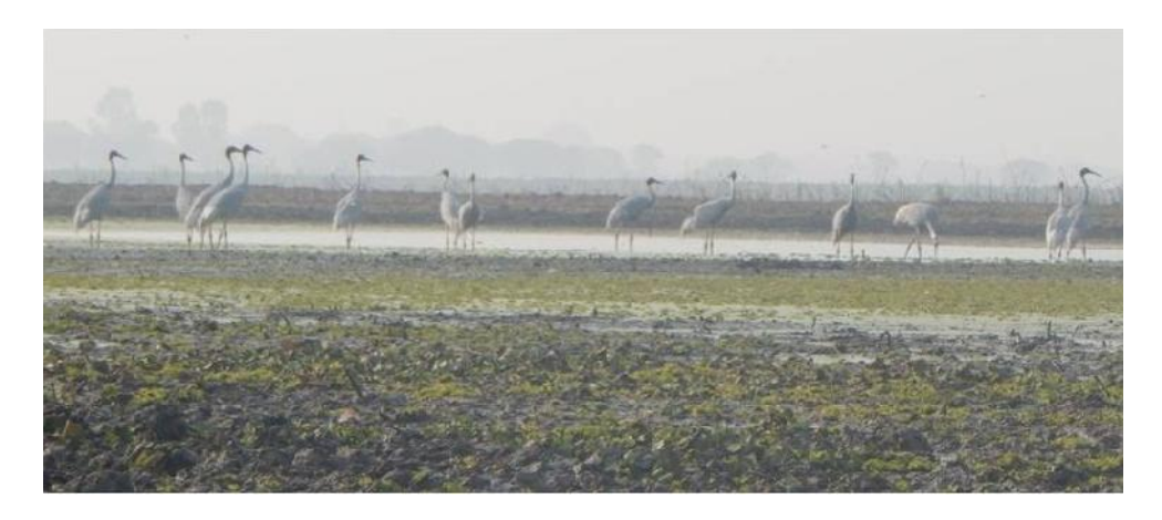
Fig. 6. Sarus crane in congregation in evening around the study area