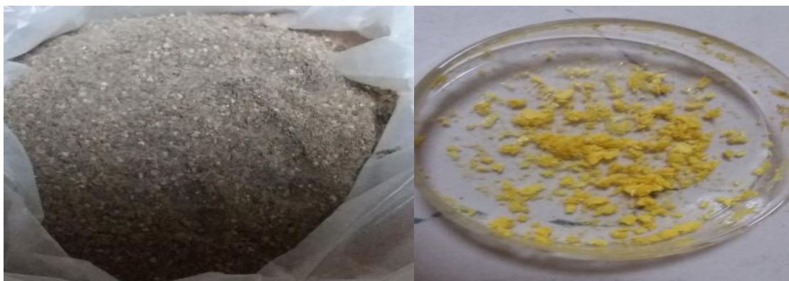
Fig. 1. Structure of P. nigrum fruit powder and extracted crystals of piperine

Piper nigrum as a drug was first defined by Hippocrates rather than a spice. Piper nigrum was commonly known as Black pepper. It belongs to family Piperaceae and kingdom Plantae occurs in approximately all habitable limestone soil, rainfall regions and generally used as a household. A major constituent of black pepper is an alkaloid piperine. It is present in highly humid areas [70]. This plant is one of the major plants to treatment of different diseases antihypertensive, hepatoprotective, antiasthmatic, hypolipidemic and has a maximum therapeutic efficiency in biological system [71]. Skin disorder, anti-inflammatory, anti-cancer, antihypertensive and nervous system benefits in stroke patients [72]. Based on the reported multiple usage of black pepper, it can also be used to inhibit the Angiotensin Converting Enzyme (ACE). Through [Hippuryl-Histidyl-Leucine (Bz-Gly-His-Leu) substrate ACE activity is determined [53].