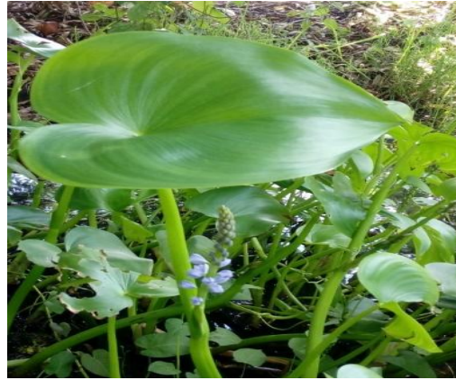
Fig. 1. The rare Monochoria africana in bloom

In this study, we embarked on ascertaining the existence of M. africana at Ozi village, Tana River county, Kenya since it was first reported there in the late 1950's as a rare species that is narrowly distributed. The authors also looked at its conservation status. The authors ultimately hypothesize probable reasons for its limited distribution in its area of endemism.