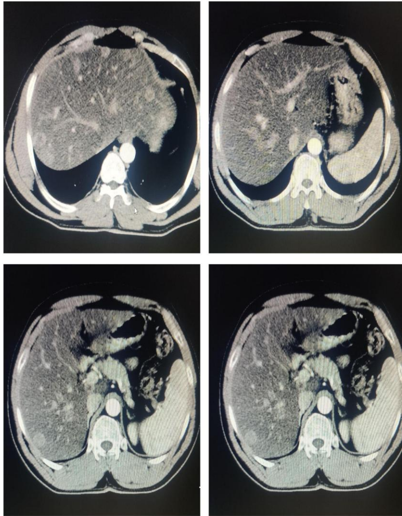
Fig. 2. Multiple (more than 15) hyper-enhancing, round lesions were seen in both lobes of the liver, the largest measuring 4x2.4 cm in segment VIII of the liver, suggestive of hepatic metastases. Metastatic abdominal, pelvic and left inguinal adenopathy was also noted in the IVC region, left common iliac and left inguinal region. The largest nodes measured 2.8x1.9 cm, 1.5x1.4 cm, and 2.1x2 cm respectively