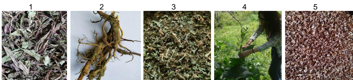
Fig. 2. Some pictures of the collected samples. The leaves of Rumex pamiricus Rech. f. (1); the roots of Rumex conglomeratus (2); the aerial part of Rumex confertus Willd. (3); The process of collecting R. Pamiricus Rech. f. (4); the seeds of Rumex confertus Willd. (5). Location: Tashkent Botanical Garden named after F. N. Rusanov.

The aerial parts (during the flowering period on May 2020) and roots (on August 2020) of the plants were collected from Botanic Garden, Tashkent, Uzbekistan.