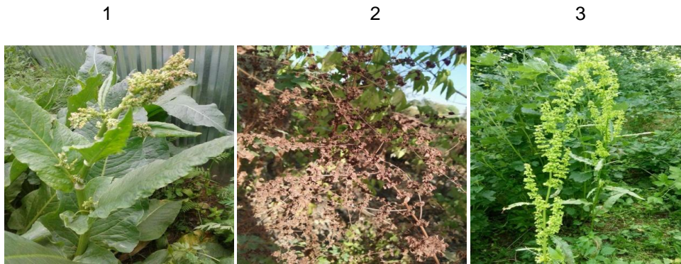
Fig. 1. R. pamiricus Rech. f. (1); R. confertus Willd. (2); R. conglomeratus Murray (3). Location: Beldersay, Chimgan mountains (Ugam Chatkal National Park), Tashkent region.

kinds of bacterial and fungal infections, e.g. dysentery, enteritis and acariasis” [30]. “ R. crispus has a long history of domestic herbal use in India and Pakistan. It is a gentle and safe laxative and useful for treating a wide range of skin problems (sores, ulcers and wounds). The root of the plant is alterative, mildly tonic, antiscorbutic, cholagogue and astringent, while the seeds effective in the treatment of diarrhea” [31,32]. In Australia Rumex species are used for the treatment of stings [33]. The extracts of some Rumex species ( R. hymenosepalus and R. maderensis ) are used as a “blood depurative” or “blood purifier” [34,35]. “Literature demonstrates that R. hastatus is traditionally used in the treatment of sexually transmitted diseases, including AIDS” [36]. “ R. nepalensis is applied to treat stomachache in Ethiopian regions. R. vesicarius is a wild edible Egyptian herb. In folk medicine, it is used as a tonic and analgesic and for the treatment of hepatic diseases, constipation, poor digestion, spleen disorders, flatulence, asthma, bronchitis, dyspepsia, vomiting and piles, among others” [37]. “The roots of R. confertus are used for liver diseases,